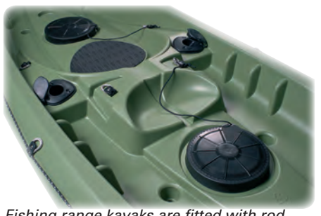
Fishing range kayaks are fitted with rod racks and watertight hatches for carrying extra equipment.