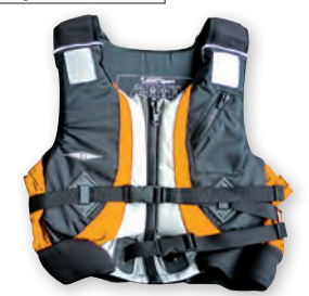
Buoyancy Aid Sport Jr/S/M/L/XL/XXL ISO EN 12402-5